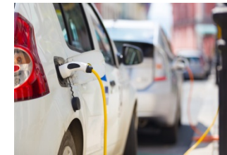
Hybrid Electric Vehicle