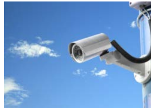
Outdoor Broadband Wireless Access